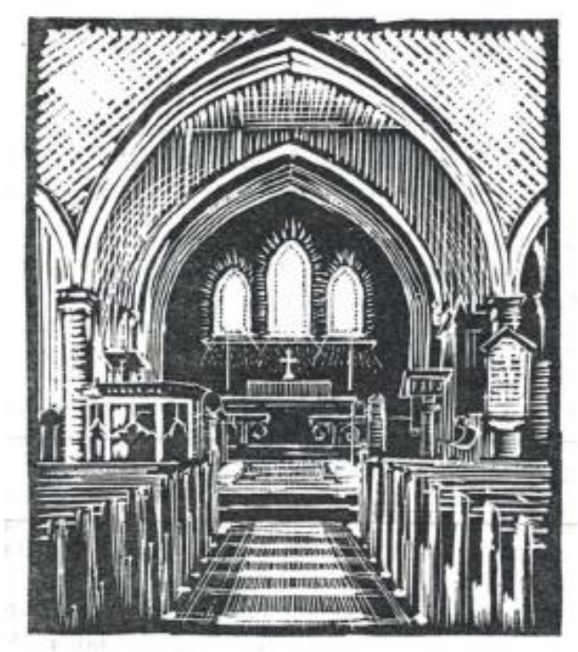
Interior of St. George's Church

Here let true faith, the fear of God and brotherly love ever remain. This place is set apart for prayer and for the praise of the most holy name of our Lord Jesus Christ; whoever liveth, with the Father and the Holy Spirit, one God, world without end. Amen.